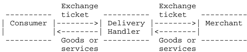
Figure 3. Coordination of untrusted participants using exchange ticket

Take the exchange ticket as an example; even if the delivery handler does not trust the consumer, the merchant that issued the exchange ticket is trusted, and if the VTS guarantees that there is no duplication in the trading process of the exchange ticket, there is no problem in swapping the exchange ticket for the goods or services. In the same way, even if the merchant does not trust the delivery handler, the issuance of the exchange ticket can be verified, and if the VTS guarantees that there is no duplication in the trading process of the exchange ticket, there is no problem in swapping the exchange ticket for the goods or services (Fig. 3). In other words, if there is trust in the issuer and the VTS, trust among the participants involved in the transactions is not required.